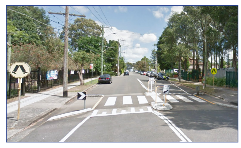
Pedestrian Crossings (zebra crossings):

• provide a set period of time for pedestrians to cross the road whilst vehicles are stopped at traffic lights